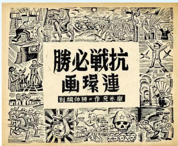
廖冰兄 (1915-2006)《抗戰必勝連環畫》 Victory in the War of Resistance Comics Series by Liao Bingxiong (1915-2006)

小知識：廖冰兄是中國著名漫畫家，1937年抗戰全面爆發後，他連續創作40多天，畫了200多張抗戰連環漫畫。